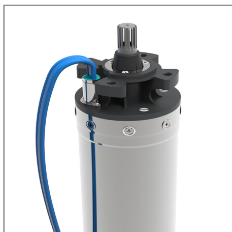
UPPER BRACKET MADE IN CAST IRON WITH CATHODOLYSIS TREATMENT